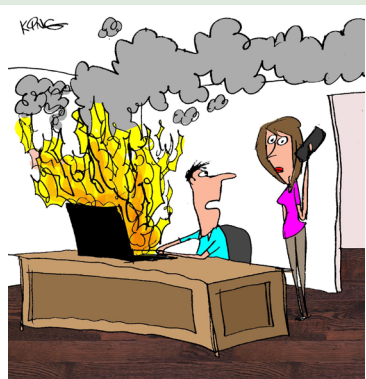
"Cancel that call to tech support. This may be beyond their capabilities."