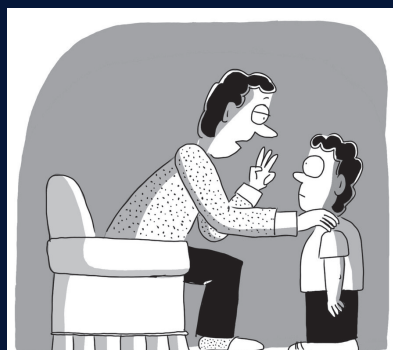
“SON, THERE ARE THREE THINGS I WANT YOU TO NEVER FORGET... NEVER GIVE UP ON A DREAM... MARRY FOR LOVE... AND USE 8-DIGIT COMPLEX PASSWORDS!”